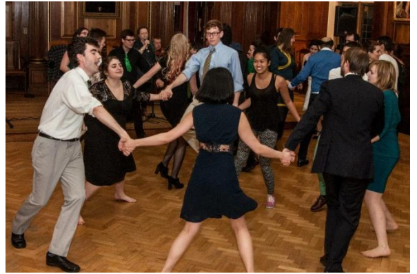
Traditional Ceilidh dancing at a Burns' Night Dinner