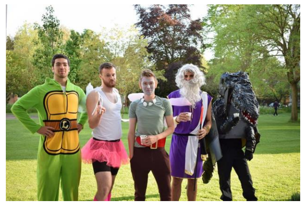
Dragons, Ninja Turtles and Elves at the "Let's Get Mythical MCR Dinner"