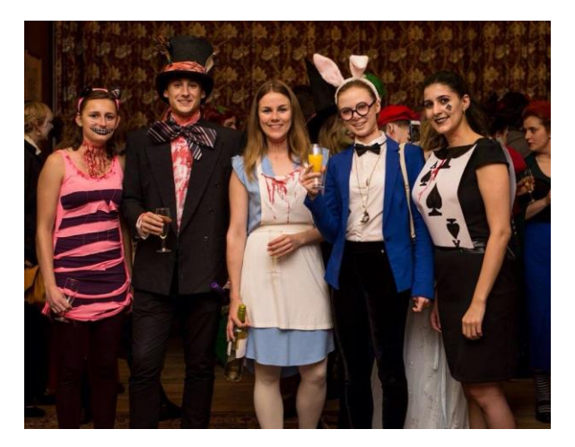
"Alice In Wonderland" at Halloween MCR Dinner