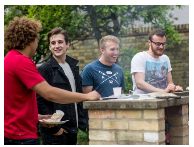
MCR Summer Barbecues at 31 Grange Road